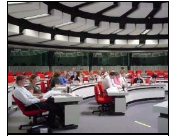
European Commission in Brussels